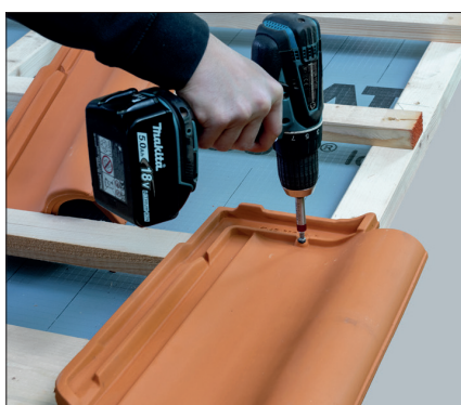
Screw fixing with neoprene washer.

Concrete tiles can be twice fixed using screws with neoprene washers.