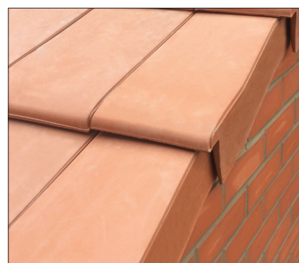
Crest Nelskamp clay right hand cloak verge.

Crest Building Products supply screws with neoprene washers, tile clips and verge clips. Please contact Crest Technical Department for advice on Site Fixing Specifications.